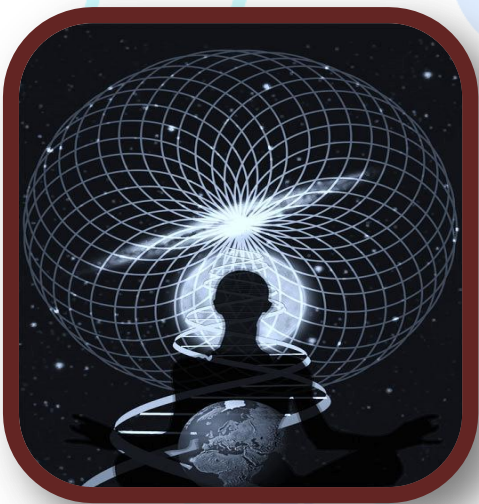
My integral connection...

A new born baby's cry announces that - he wants to be acquainted with his environment. He desires to search inherent relationship with his surroundings. Virtually through this inner instinctive feeling of 'oneness' he aspires to secure his existence. Eventually he wants to evolve his stay and feels his existence, with the reference of realization of existence of every matter of this whole creation around him; since, he is also one of the most conscious units of the total evolution of the creation. Now, he finds ultimate shelter of his immediate existence in his mother's heart, and in the very moment that (mother's affectionate embracing) becomes his extreme world of existence. So, he holds his mother as his own extension. This intrinsic 'attachment' is the existential approach to life - which is called 'libido'. Attachment with the existential shelter - is a universal demand of life including human being; - because it is blended with the law of evolution, making close bonding within each matter, since creation.